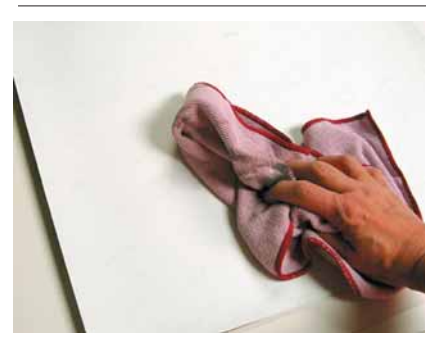
Photo 5: Microfiber cloths are perfect for removing dirt and dust prior to mounting photos. The back of image and the mount board both need to be wiped.