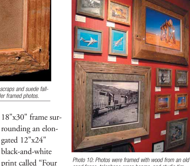
sand fence, telephone cross beams, and studio tim-

Greg realized that the cross arms might be perfect for frames. Rich, dark, rustic frames were cut from alternate sides of the heavy 4-1/2" beams, leaving the inner few inches for potential use as smaller frames. One result was an