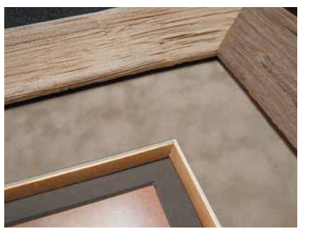
Photo 3: A sand fence frame was accented with Brushed Pewter and Copper Gold Precious Metal paper-wrapped 3/16" foam bevels as a visual spacer between the top and bottom mats.

Because of the wide nature of the frames, we had to increase the mat borders to 5" or narrow them to allow for a contrast between the mats and the frames. We opted for 3" borders for the liner mat and 2-1/4" for the suede top mat, making the outside dimensions 22"x26" plus 1/8" allowance. The wrapped bevel uses color to draw the eye inward from the outer frame to the color and metal of the engines, helping unify the design. Keeping the mats narrower also allowed the frames and photos to remain the dominant elements. Since the frames were being built to