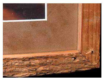
Photo 9: Narrower inner wood scraps and suede fallouts were used to create smaller framed photos.