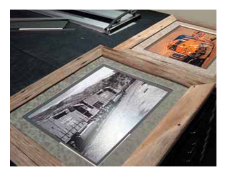
Photo 2: Mist Suede matting was used on blackand-white images while Dusk was perfect for the color photos.

chosen. Artcare Mist Suede #4196 was the perfect pale gray-green color to make the transition from the sand fence frame to each of the photos (Photo 1). Dusk Suede #4195 was a perfect match for the texture and colors of the sandy earth beneath the tracks and in the engine in his color images (Photo 2). Brushed Pewter and Antiqued Copper Precious Metal paper was selected to wrap 3/16" foam bevels as a visual spacer between