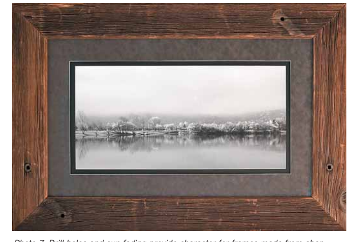
Photo 7: Drill holes and sun fading provide character for frames made from abandoned telephone pole cross arms from the desert.

my specifications (22-1/8"x26-1/8"), I was able to mount the photos, cut the mats, and assemble the package in preparation for the frames. The glass was not cut until the frames arrived to verify size for final fitting.