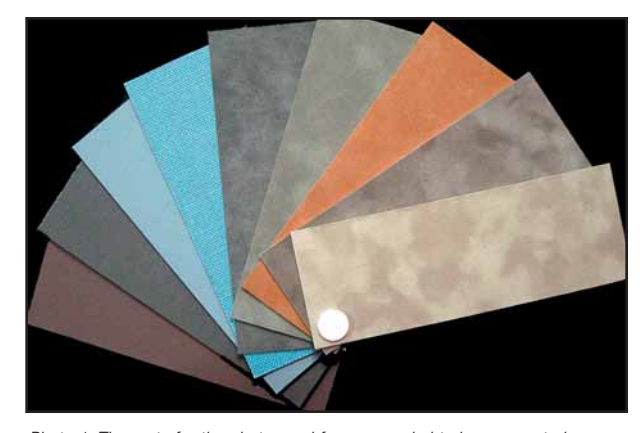
Photo 1: The mats for the photos and frames needed to have a neutral palette. (L to R) Rag Mat Sable Brown 1184; AlphaRag Black Shadow 8669; AlphaRag Colonial Blue 8651; Degas Blue Linen 4026; Artcare Shadow Suede 4197; Artcare Mist Suede 4196; Crescent Twig Suede 5639; Artcare Fango Suede 4206: Artcare Dusk Suede 4195.

for the high desert, railroad, and anything to do with airplanes. Though he has been photographing area terrain and attractions for a long time, he had never exhibited his images in a formal gallery. Greg, who owns Milepost Imaging in Tehachapi, CA, is an avid hiker who ventures into the Mojave Desert for hours following old railroad tracks for unexpected photographs. On one such trip he found some buried, deteriorating wood boards that may have once been a fence used to prevent excess sand from building up around the tracks. Most of these planks were cracked, warped, rotten, and very