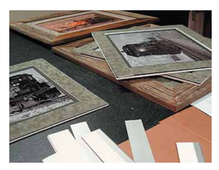
Photo 4: Four black-and-white and two color photos were mounted, with the mats cut and assembled, awaiting the frames.