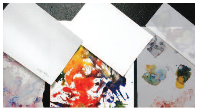
(L-R) TerraSkin made of calcium carbonate/polyethylene resin; Yupo polypropylene opaque white 74# and 144#; and Yupo translucent 104#.