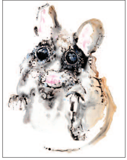
"Challenge Yourself" by Tina Dille is a 26"x40" is watercolor on opaque white Yupo. The vast expanse of white negative space surrounding the image is a formal part of the painting and cannot be cut or covered. This smooth, unpainted white area allows visible undulations from adhesive application or substrate choice to be visible

Artists often use ATG two-sided tape to hold Yupo to a painting board. Since Yupo is a multiple-ply laminated sheet, the bottom layer may be split from the core if the P-S adhesive is not softened or dissolved with solvent prior to removal. A chemical solvent does not