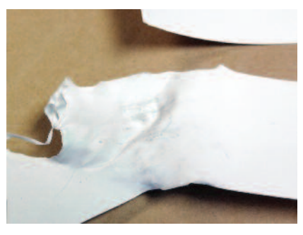
TerraSkin recoils badly at highest setting of a clothes iron but is fine with tacking iron. Heat should remain below 150oF. TerraSkin UV degradable paper is marketed as "paper made of stone."

back corners of the Yupo, sometimes Windex or Dirtex helps remove the adhesive tape. However, the ammonia in the contents removes dirt, grease, and latex (acrylic) paint or sealer, so framer beware. All too often, repairs end up being far worse than the original damage. These details should always be written in a condition report and be pointed out as damage to the client, including artists, when the original is first brought in. The divot created by the loss of the paper layer could show after mounting.