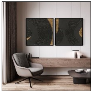
photo 1 - WGSN/Coloro COTY palette Spring/Summer 2025.

photo 2 - Paint manufacturer COTY: Valspar, Dutch Boy, HGTV Sherwin Williams, C2, Graham & Brown, Dunn-Edwards, Little Greene, Behr, Benjamin Moore, Minwax, Glidden, Dulux, and Stainmaster.